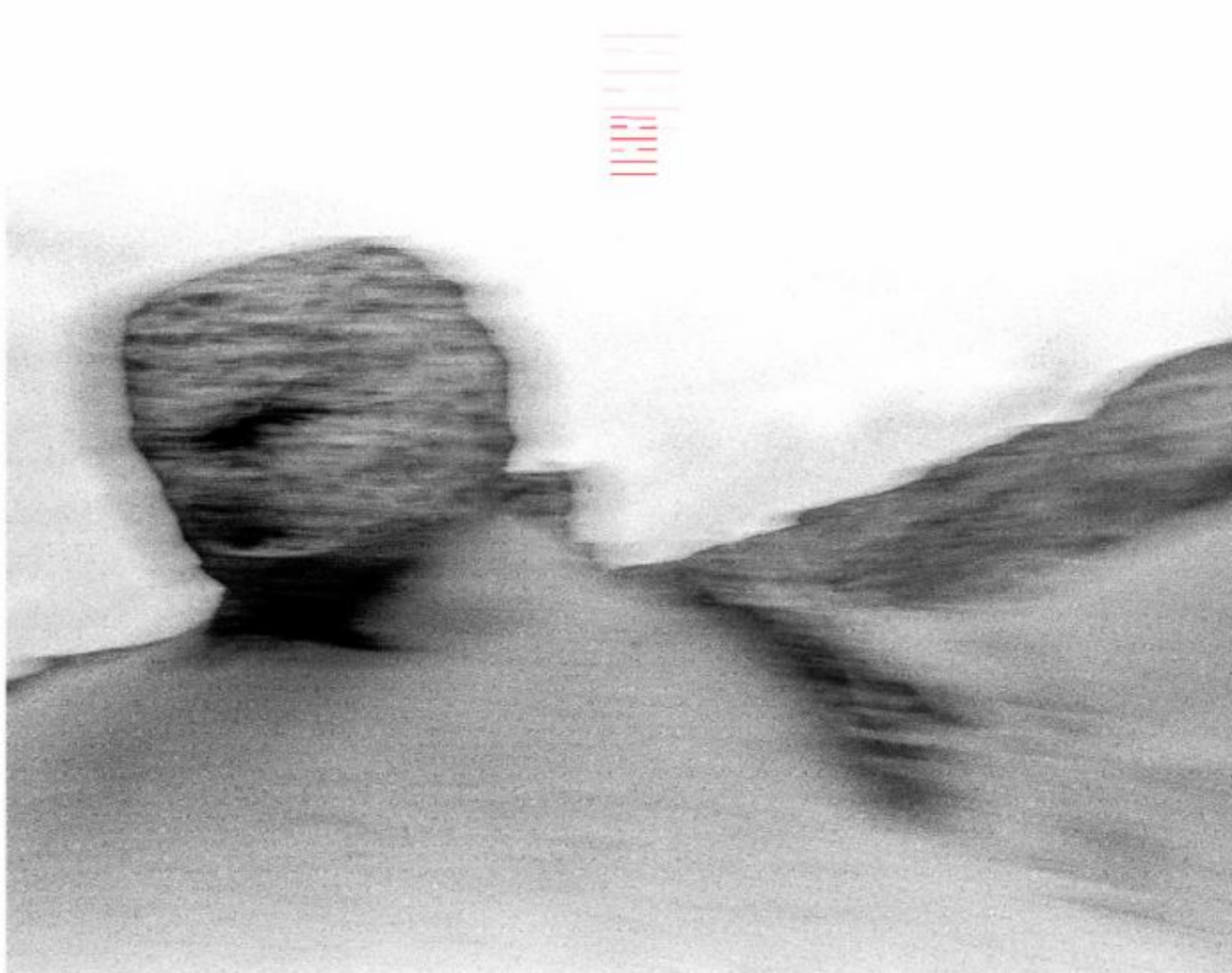
The Movement of Heaven is Full of Power.--I Ching

I highly recommend reading the rest of the article . Let me know what you think.