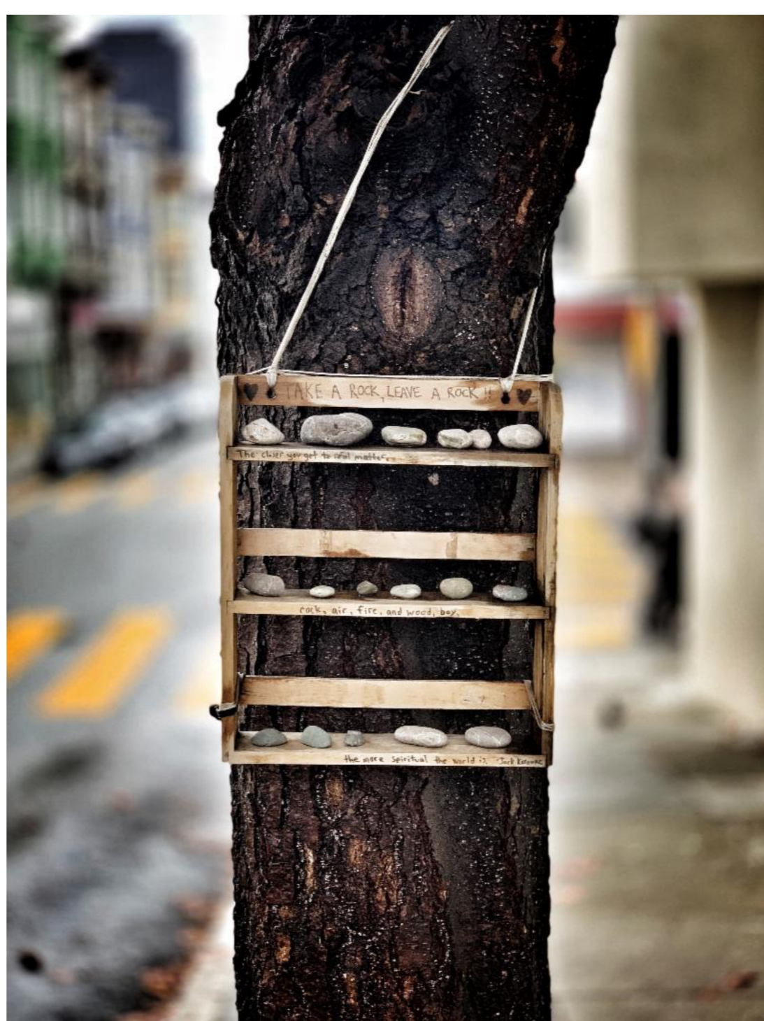
I found this rock rack on a walk around our neighborhood. Remember when "pet rocks" were so popular in the mid 70s?